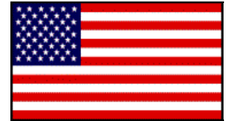
NATIONAL FLAG OF USA