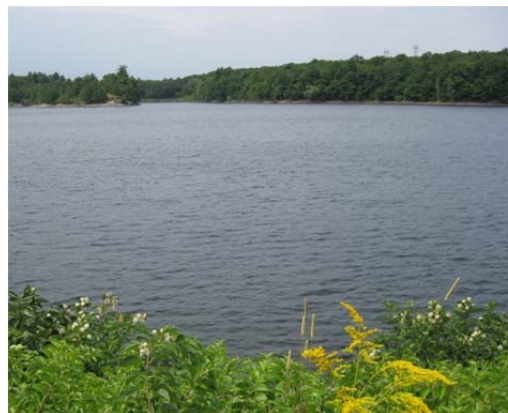
Mill Pond Reservoir